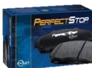
Brake Pads by Bosch