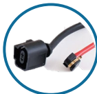
Brake Wear Sensors